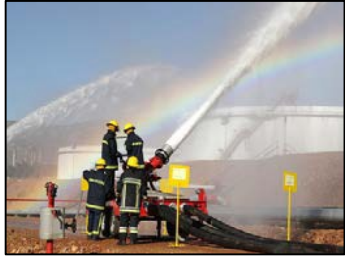
Aqueous Film-Forming Foam