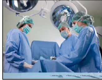
Healthcare and Hospitals