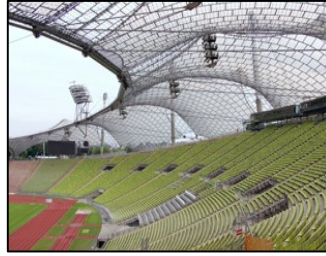
Building and Construction