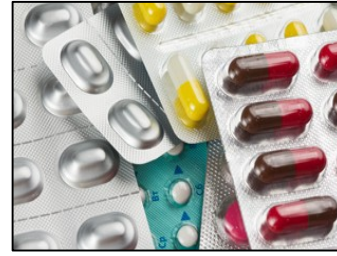
Chemicals and Pharmaceuticals